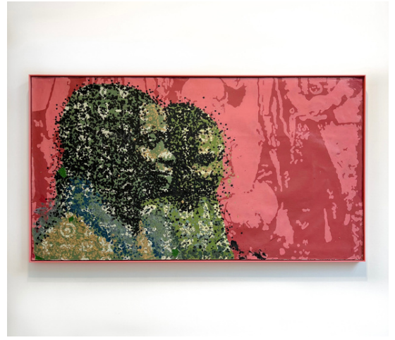
Yeanzi Série Colloquium, Untitled, 2022 Artwork selected for the 59th Venice Biennale Melted recycled plastic on canvas 200 x 180 cm